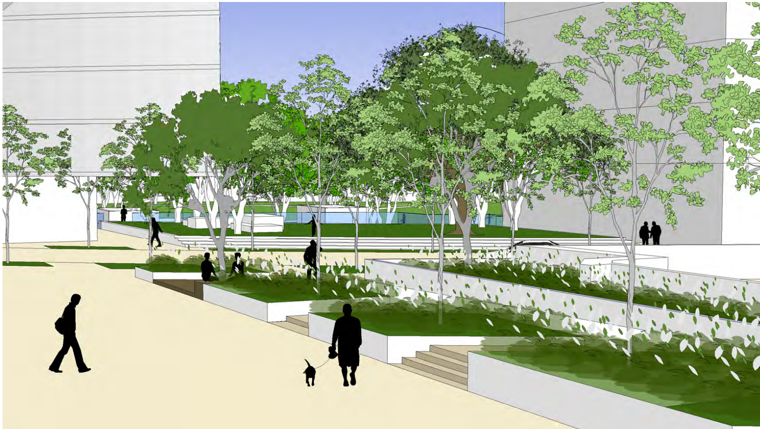
Station Plaza view 1