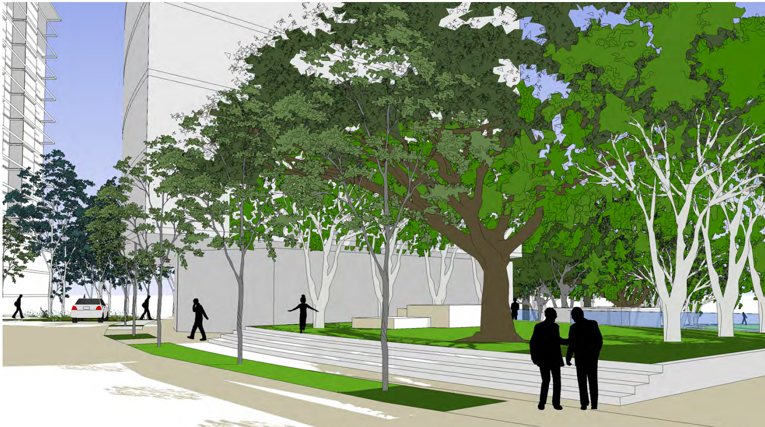
Station Plaza view 2