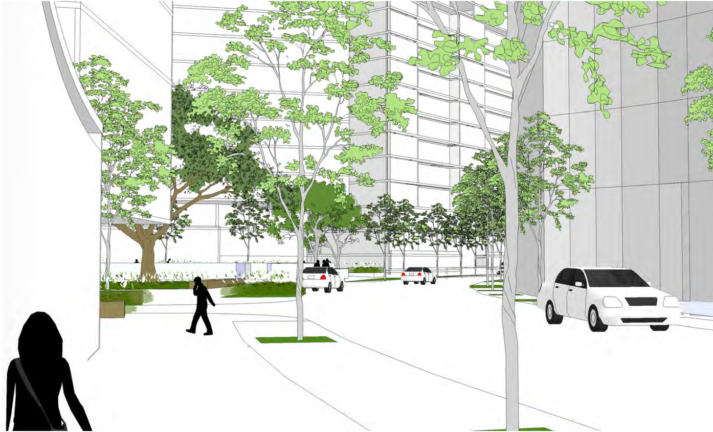
Station Plaza view 3